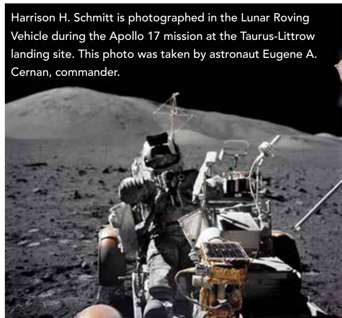
Harrison H. Schmitt is photographed in the Lunar Roving Vehicle during the Apollo 17 mission at the Taurus-Littrow landing site. This photo was taken by astronaut Eugene A. Cernan, commander.